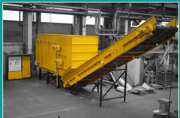
EuRec Bunker ADS-2

Contact us today, our team of experts give advice and assistance.