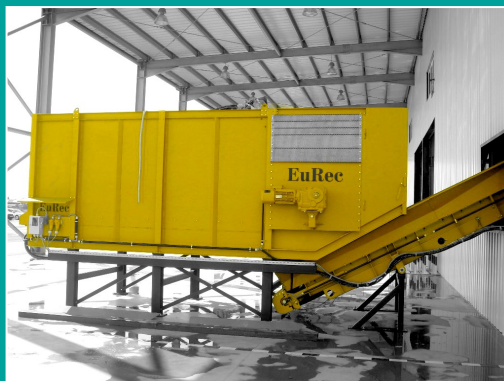
EuRec Bunker ADS-1

For a very large throughput, available with additional reversing conveyor mounted in horizontal position on top of bunker.