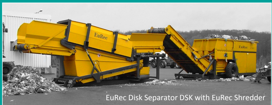
EuRec Disk Separator DSK with EuRec Shredder

Contact us today, our team of experts give advice and assistance.